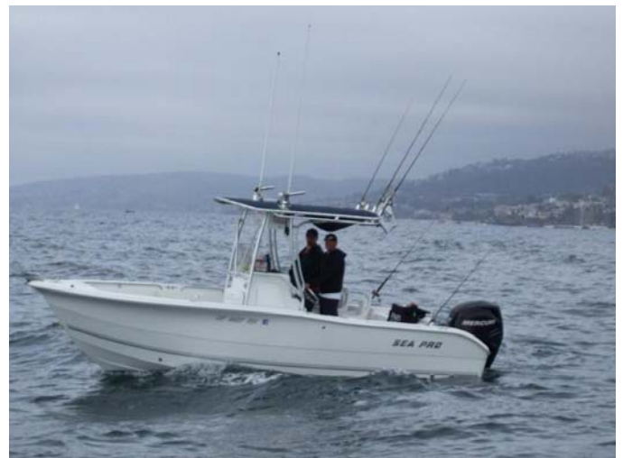
TOP BOAT—DIRTY DEEDS