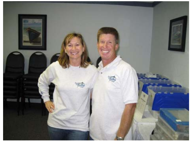
THE SOCIAL TEAM