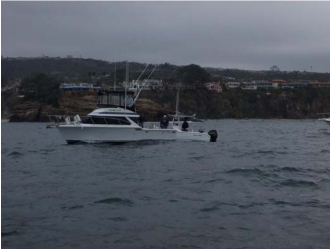
DIRTY DEEDS PASSES OFF HOT LURE TO MOORE FUN