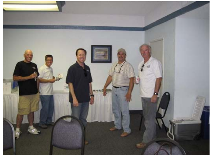
CAUGHT IN THE HEADLIGHTS