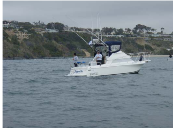
DAN & DAVE ON SKIPPED OUT