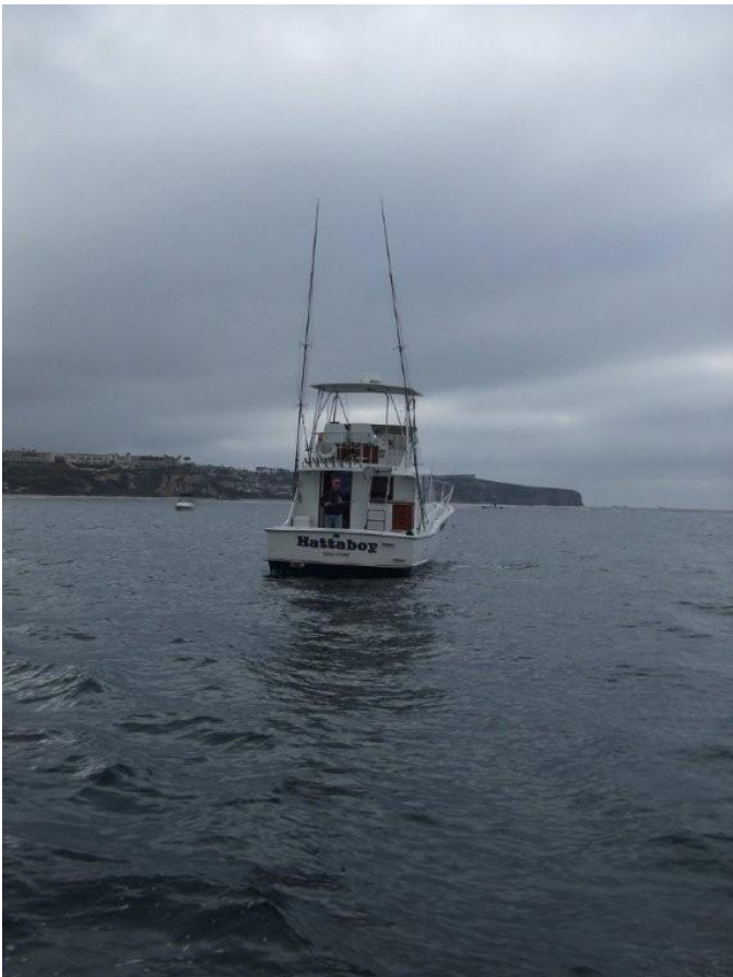
GEOFF DRIFTING ON HATTABOY