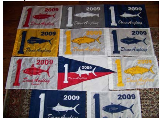
2009 FIRST FLAGS