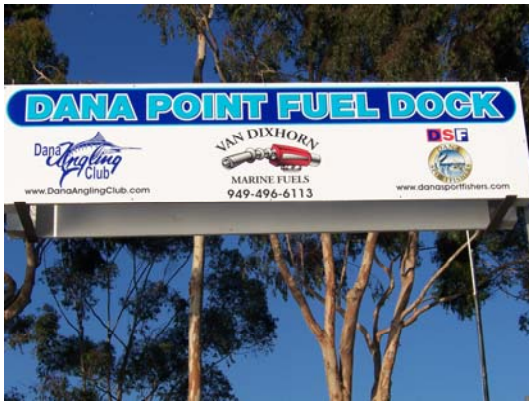
New Fuel Dock Scale Sign