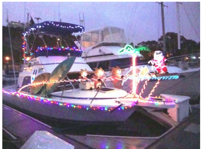
ESCAPE ROUTE WITH SURFING SANTA